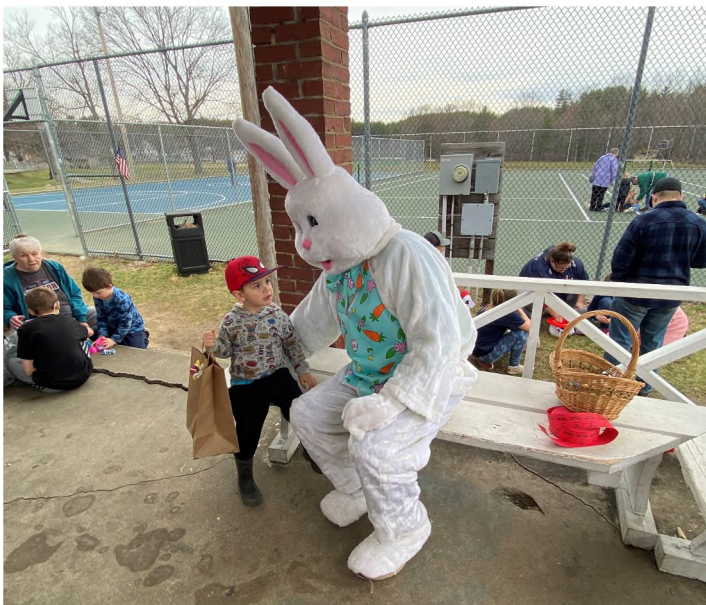
Easter Egg Hunt 2022