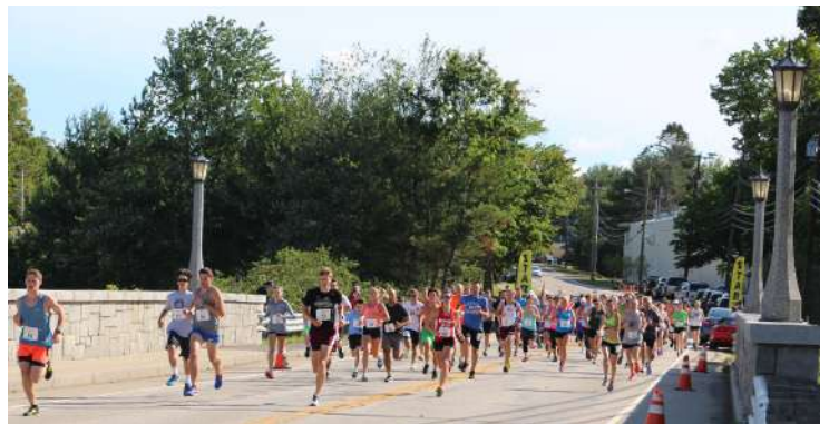
Start of the 2017 Frank H. Donovan 5K