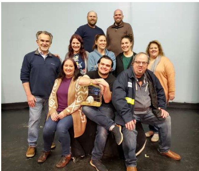
Cast of the The Curious Incident of the Dog in the Night-Time

The Curious Incident Cast is Going "Off the Grid."