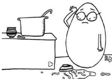
Egg Drop Soup

Serve soup with additional chopped scallions.