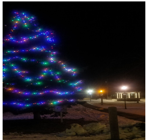
2018 Christmas Tree by Louie Houle

Please Note: The Children’s Store is still accepting new or gently used gift items for caregivers, parents, family, friends and teachers. The store could also use men’s items. If you’re out and about shopping, please keep this in mind; small tools, flashlights, work gloves, hats, mugs, no clothing please. Donation boxes are located at the Pittsfield Post Office, Epping Well, Northway Bank, Main Street Variety, Town Hall and Jitters Café.